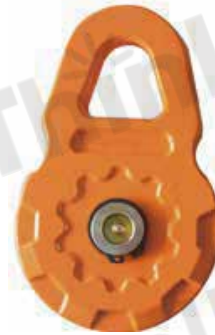
Custom Snatch Block