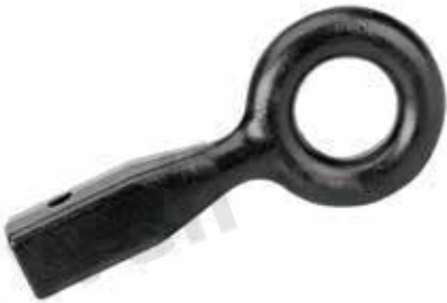
Forged Tow Eye