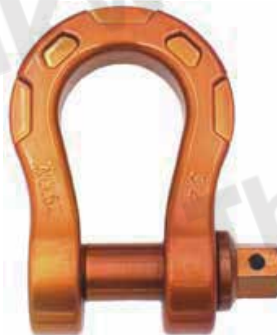
5T Aluminum Bow Shackle