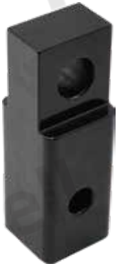
5T Hitch Receiver