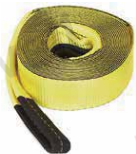
3"*30ft Tow Strap