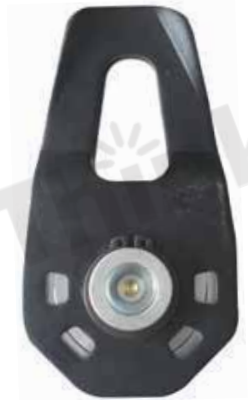
Steel Mega Snatch Block