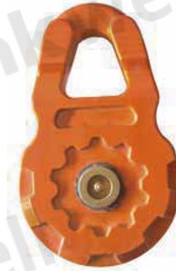
Aluminum Snatch Block