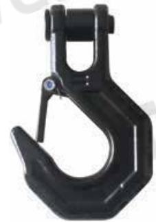
Custom Winch Hook