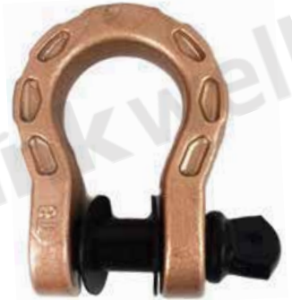
8T Mega Bow Shackle