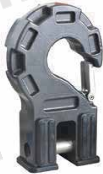
Aluminum Winch Hook