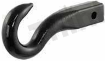
Forged Tow Hook