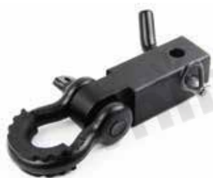
2" Shackle Hitch Receiver