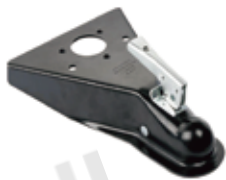
TKT102 Ball Size: 2" Capacity:5000lbs