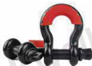
3/4" D Ring Shackle