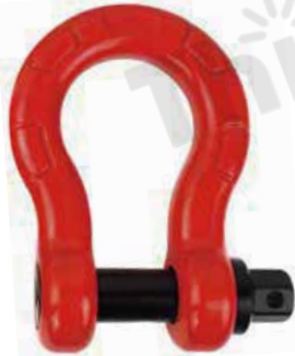
10T Round Mega Shackle