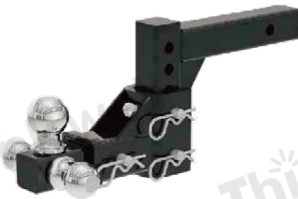
Adjustable Steel Triball Mount

Capacity: 6000lbs Box size: 2"x 2" Max rise: 8-3/8" Max drop: 9-5/8" Length: 12" Shank: hollow