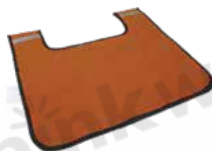
Winch Cable Dampener