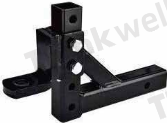
Adjustable Steel Ball Mount (Type II)