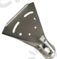
TKT103 Ball Size: 2" Capacity:5000lbs