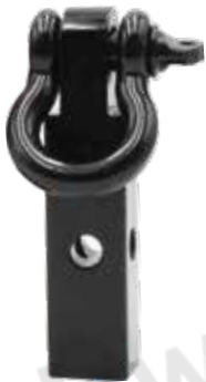
2T Hitch Receiver