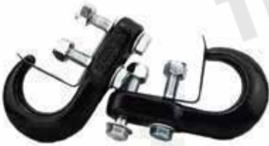
Tow Hook with Latch