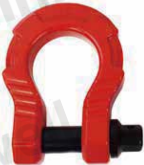
10T Square Mega Shackle