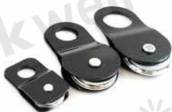
4T/8T/10T Snatch Block