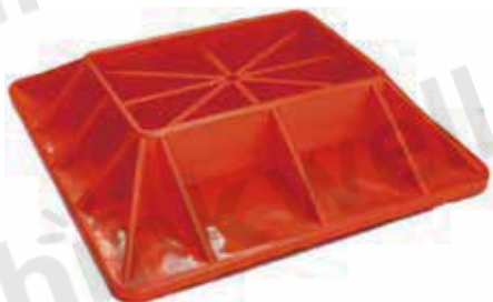
Farm Jack Base